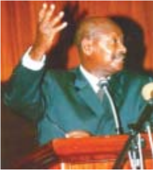
President Yoweri Museveni

President Museveni delivered a State of the Nation Address to Parliament attended by the Speaker, Hon. Edward Ssekandi, Members of Parliament, and other dignitaries on June 07, 2005. Below are excerpts from his Address.