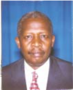
Hon. Sam Kutesa, Minister of Foreign Affairs.

President Museveni, while launching the Blue Book on Investment prepared by the Japanese Bank for International Development Cooperation and UNCTAD, on June 15, 2005 in Kampala thanked the G8 Countries for cancelling the debts of the highly indebted developing countries.