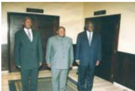
L-R: Presidents Yoweri Museveni, Benjamin Mkapa, and Mwai Kibaki, Dar es Salaam, May 30, 2005.

At the 3rd extraordinary EAC Summit, May 29-30, 2005 in Dar es Salaam, their Excellencies Presidents Yoweri Museveni of Uganda, Benjamin Mkapa of Tanzania, and Mwai Kibaki of Kenya considered the