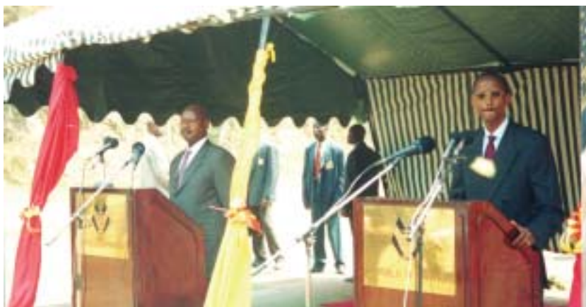
Presidents Yoweri Museveni and Paul Kagame, at an earlier Meeting.

The President reported that substantial progress had been made in the electoral process following the democratisation move now taking place in the region. He informed the Summit that women had also been empowered in various areas such as