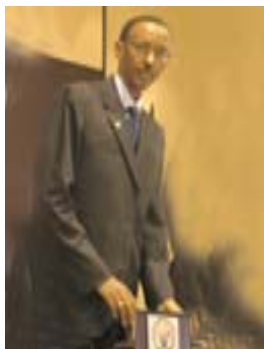
President Paul Kagame addressing the COMESA Summit, June 02, 2005.

President Yoweri Museveni called upon Member States of the Common Market for Eastern and Southern Africa (COMESA) to expedite the implementation and expansion of organisation's free trade area and customs union with a common external tariff in order to minimise external shocks and participate in the global economy as partners.