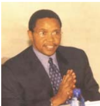
Hon. Jakaya Kikwete, Chairman EAC Council of Ministers.

The 11 th Extraordinary Meeting of the Council of Ministers was held on May 23, 2005, in Arusha, Tanzania.