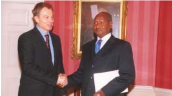
President Museveni with British Prime Minister Tony Blair. He has assured Development Partners of Uganda's commitment to Constitutionalism.

President Yoweri Museveni has pointed out that since 1986 Uganda has been a people's democracy, and the people retain the authority over the country's destiny in crucial matters, if necessary through referenda.